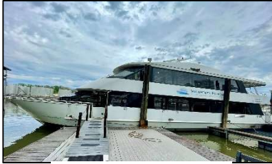
The Volunteer Princess