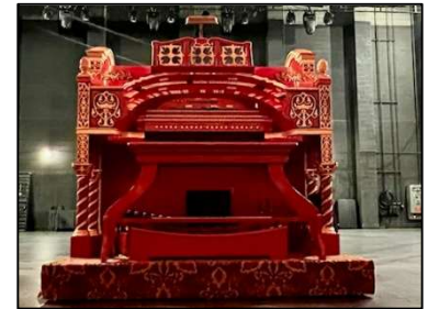
The Mighty Wurlitzer organ