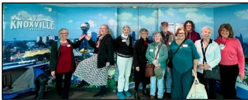
At the Sunsphere