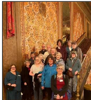
The Tennessee Theatre Tour