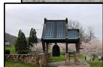
Friendship Bell in Oak Ridge