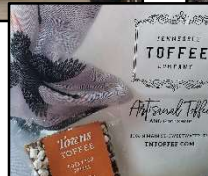
Towns Toffee, Sweetwater