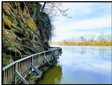
Ijams Nature Center

We have a stimulating 8 days of programming starting with the Greek Fest on Friday, September 27. On Sunday, September 29, we will take our delegates on the Volunteer Princess for a river cruise. It is the 1 PM sightseeing cruise, and you are welcome to make your own reservation to join us!