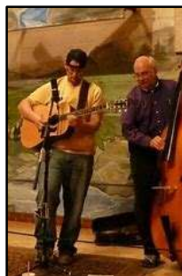
Music at Rocky Branch Community