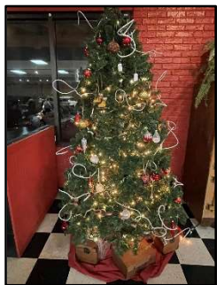
FFK Holiday Dinner at Holly's Gourmet Market

Thirty-four FFK members and guests enjoyed a festive dinner at Holly's Gourmet Market on December 10 th . Enjoy the photos below and check out the club's Facebook page!