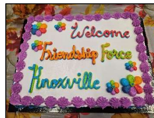
Beautiful cake from the Welcome Dinner