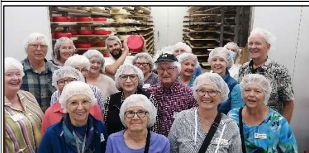
In hairnets for the tour of a local artisan cheese factory. The head cheese maker is holding up a cheese in the back.