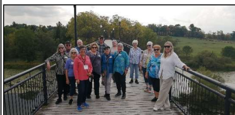
Together with new friends