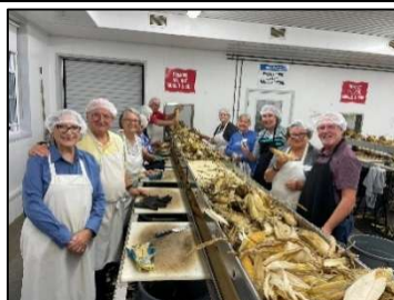
Hands-on at the Reapers of Hope facility that prepares vegetables to be used in dried soup mixes.