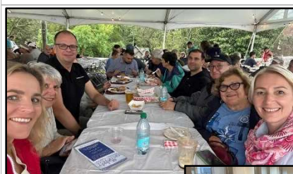
Left: Enjoying the Greek Fest