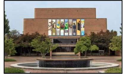
Clarence Brown Theatre

If you haven't heard, CBT has been recognized as one of the top 25 college and university theatres in the world! That's right, not just in the USA, but in the world. Every year CBT puts on the holiday show but with different actors and different sets, and somehow the quality of the performances gets better and better. If you are feeling " Bah Humbug " about the whole idea, then this production is for YOU! We have obtained the group ticket price of $45 for the matinee on Sunday, November 24 at 2pm . After the performance, let's extend the merry making and break bread together! The Fieldhouse Social at 2525 Commons Way is near the theatre, has lots of free parking in a covered area, and their menu has plenty of options. It'll be a great time to enjoy world class performers, delicious food and drink, and the best part-each other's company.