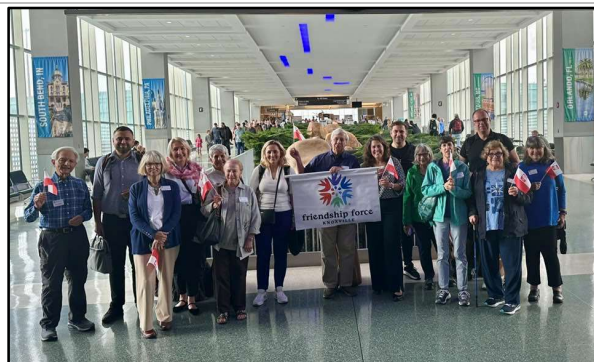
Meeting our visitors from Poland at the airport with Mayor Kincannon