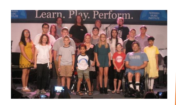
August Showcase Performers