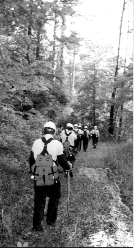
Grid searches involved stretching 18 firefighters along a 180-foot line.