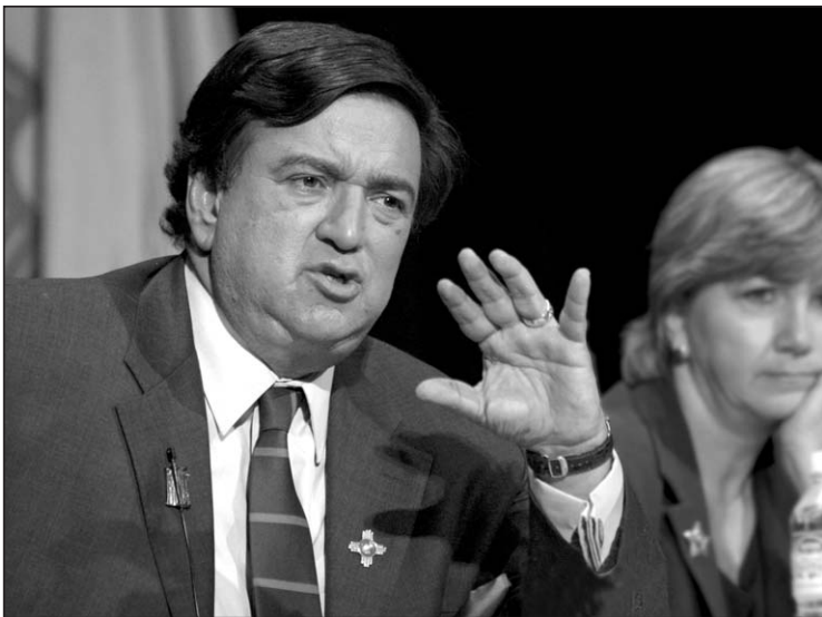
Future drug-treatment contracts, says Gov. Richardson, shown here speaking at his Governor’s Drug Summit, will require collaboration and be tied to performance-based outcomes. Of the $1.5 million in new funding, $500,000 will be used to expand residential treatment.

Valerio says the plan must expand the number of inpatient treatment beds so addicts don’t have to wait months for treatment.