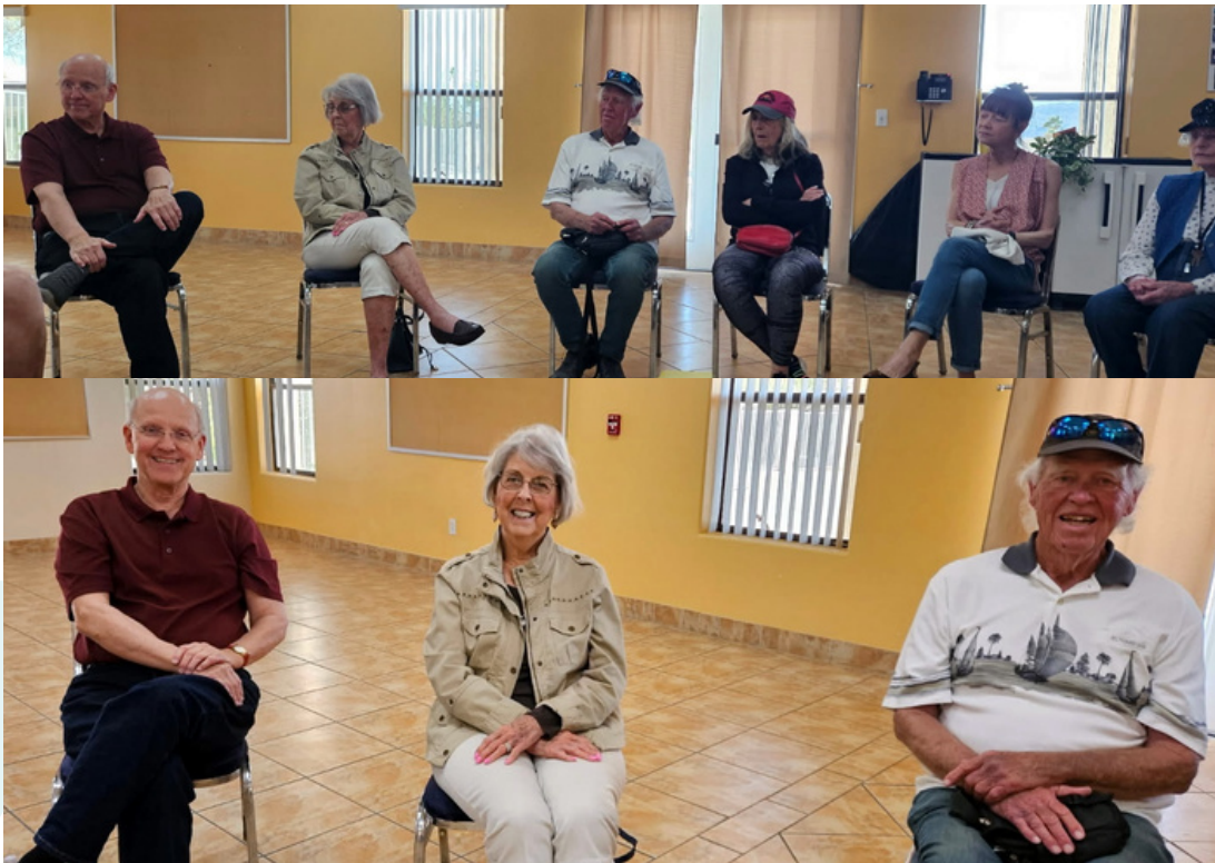
Images from our Story Share Gatherings