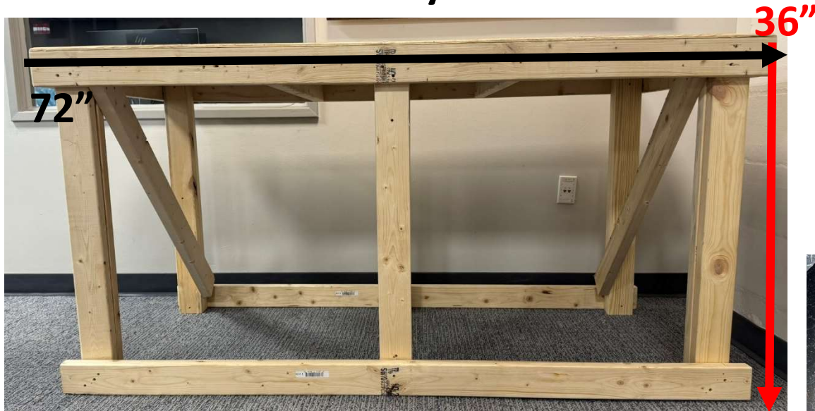
Forcible Entry Platform