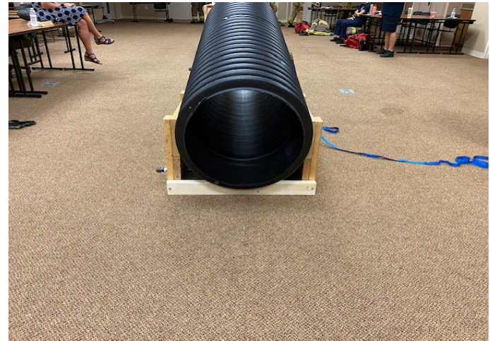
Plastic Tube Exit 3" off floor