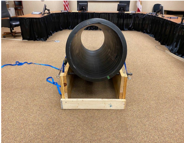
Plastic Tube Entrance 18" off floor