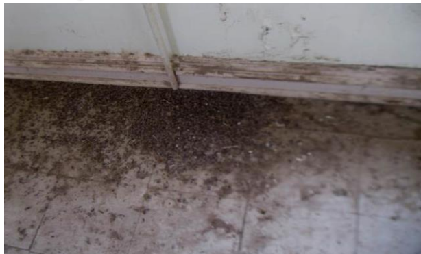
Bat guano accumulation in garage

Asbestos and lead-based paint detected throughout multiple areas of site.