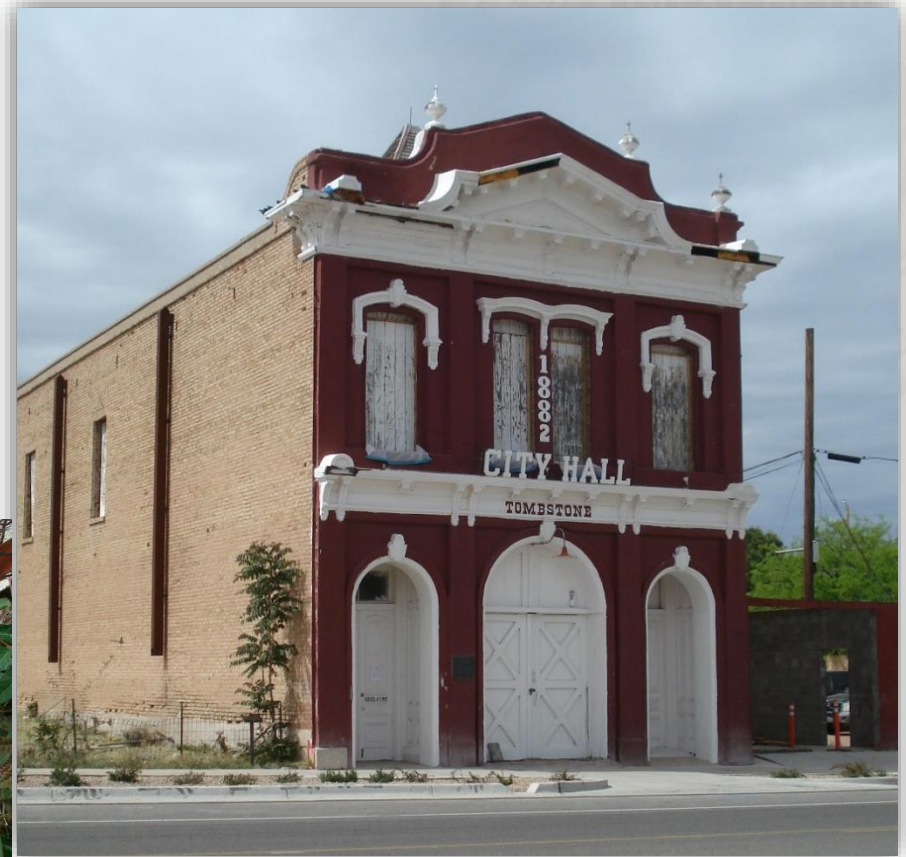
315 E. Fremont St. Tombstone, AZ 85638