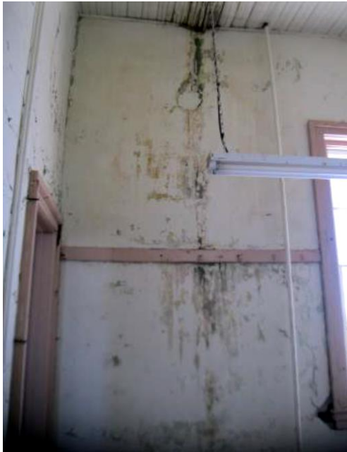
Water damage to walls and ceiling