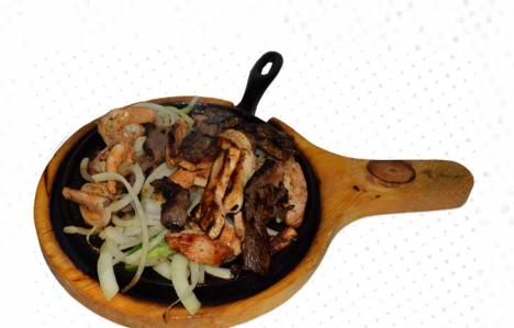
Viento mar y tierra