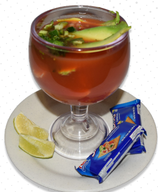
Coctel de Camaron

Shrimp a la diablo/Camarones a la diablo $12.50