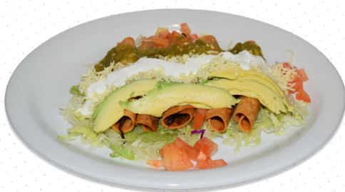
Flautas Estilo Mexico