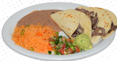
Tacos al carbon