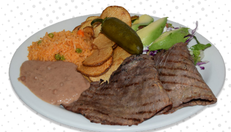
Bistec con papas