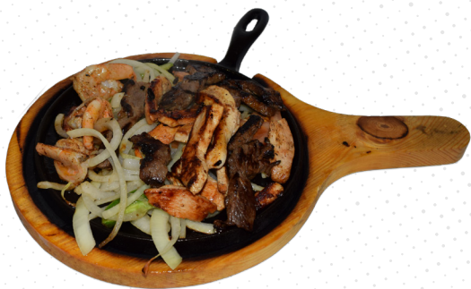
Viento mar y tierra