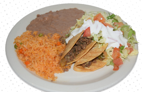
Taco Dinner (Crispy)

CAUTION: Fresh Fish may have small bones. La Tortilandia is not responsible for individuals allergic reactions to seafood. Eating oysters may cause severe sickness, even death in people with liver ailments (alcoholics, cirrosis, hepatitis, etc.) cáncer or other sickness that weaken the immunizations system. If you eat oysters and feel sick, get medical attention immediately.