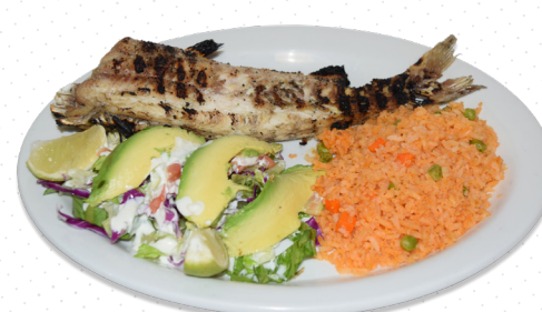
Pescado a la parilla