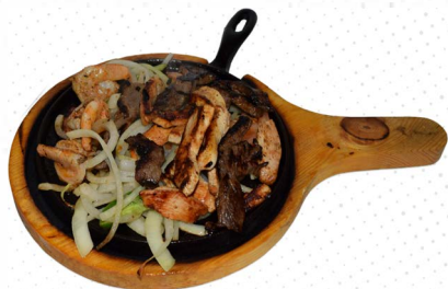
Viento mar y tierra