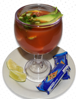
Coctel de Camaron

Shrimp a la diablo/Camarones a la diablo 14.99