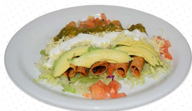
Flautas Estilo Mexico