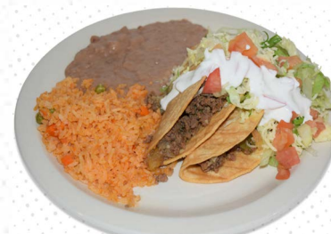
Taco Dinner (Crispy)

CAUTION: Fresh Fish may have small bones. La Tortilandia is not responsible for individuals allergic reactions to seafood. Eating oysters may cause severe sickness, even death in people with liver ailments (alcoholics, cirrosis, hepatitis, etc.) cáncer or other sickness that weaken the immunizations system. If you eat oysters and feel sick, get medical attention immediately.