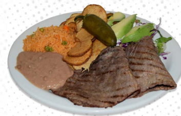
Bistec con papas