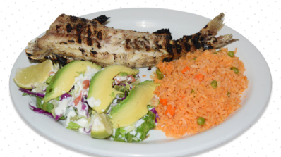
Pescado a la parilla