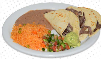
Tacos al carbon