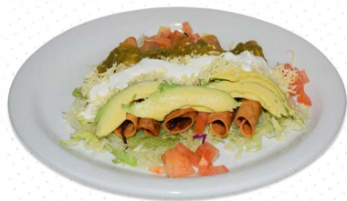
Flautas Estilo Mexico