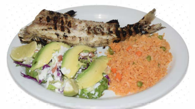
Pescado a la parilla