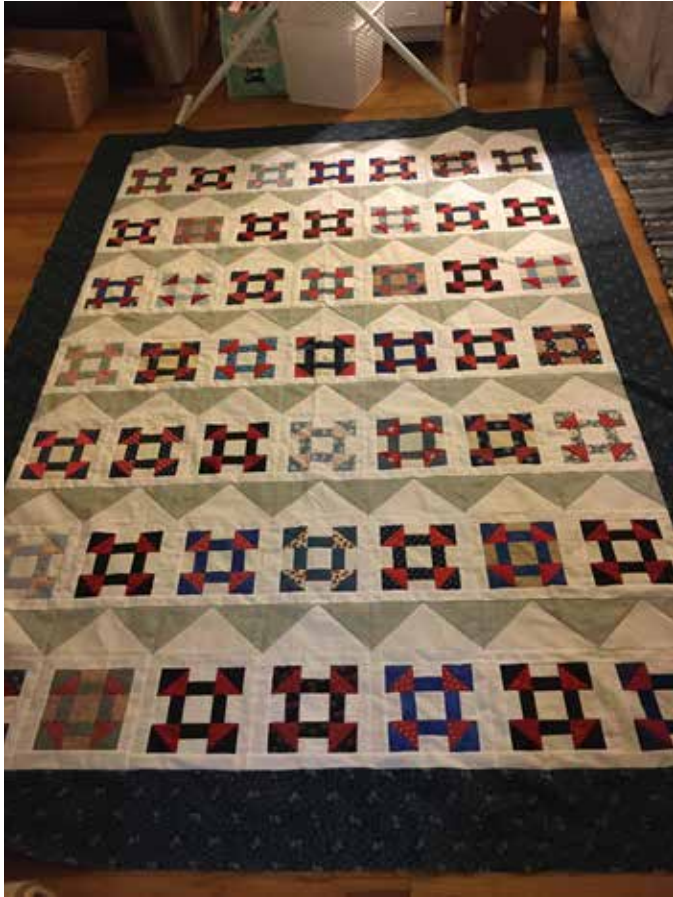
CAMEO TOGETHER 2020 QUARANTINE QUILT - made by CAMEO members