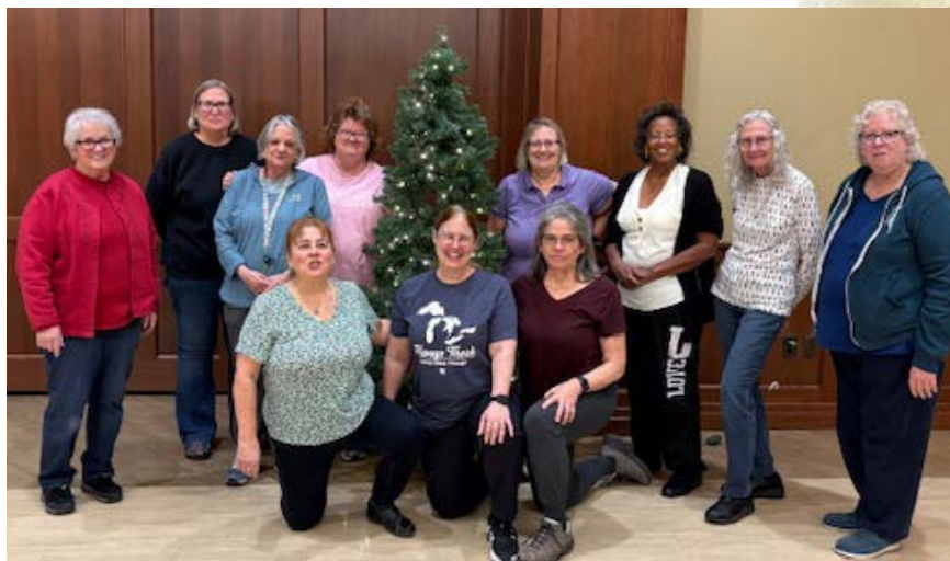
Some of the Sleep at Home Retreat attendees - December 2026