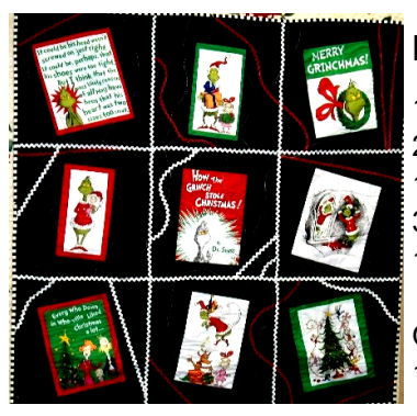
44" x 44"