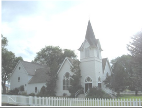
Lamoille Community Presbyterian Church