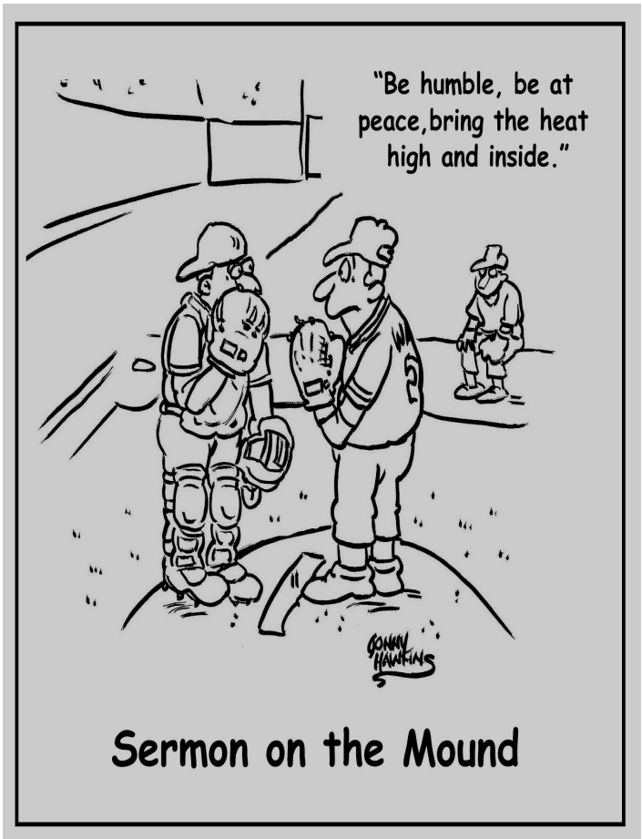
Sermon on the Mound