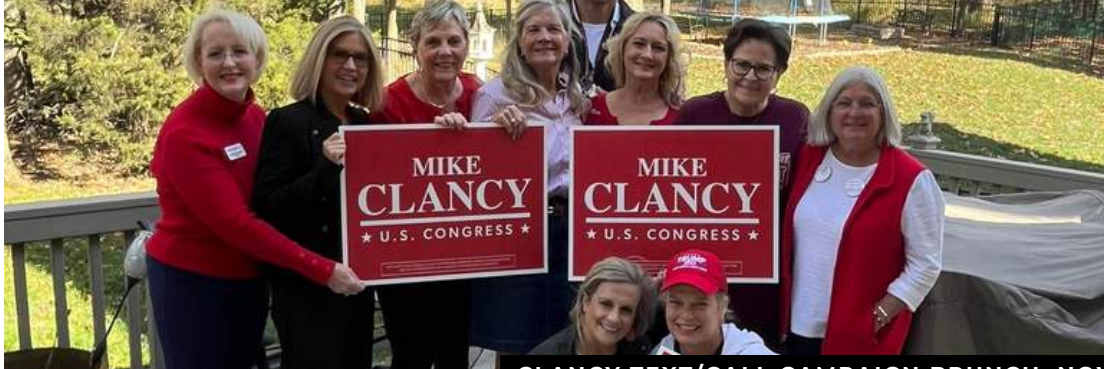
CLANCY TEXT/CALL CAMPAIGN BRUNCH, NOV. 2