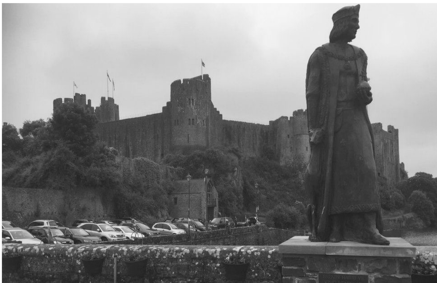
Pembroke Castle with the Statue of Henry Tudor