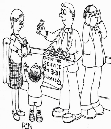
The treasurer still had a trick up his sleeve