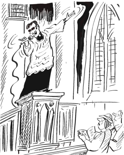
The vicar got a little carried away with the church's new state-of-the-art PA system