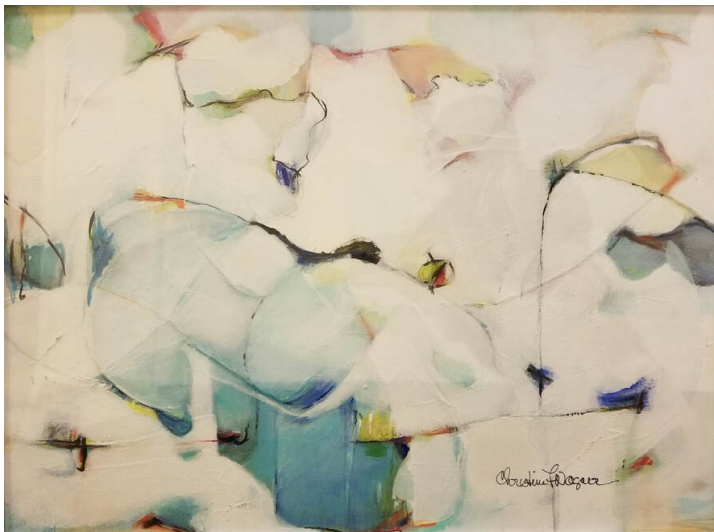
It's Not For Me To Say by Christine Wagner

"Art has been my passion since early childhood, drawing the figure and faces in particular. Acrylic paints are my medium of choice and my current abstract paintings are about the process and are started without a predetermined conclusion – I paint intuitively. As I apply the brush to the canvas and paper varying both thick and transparent layers of material, erasing and reconstructing, the positive and negative spaces emerge and the underpainting perhaps will be visible. My artworks are speculative formations that create themselves through my personal perception and interpretation. The journey or process is never the same. I find painting with the ease of acrylic paints and in abstractions is very freeing and have not yet tired of this medium or style, however painting larger is what I am pursuing at this time."