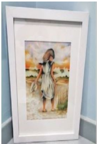
Girl On The Beach

She also has two new colored pencil pictures at the Makt Art Studio and Gift Store, along with numerous stained glass she has made.