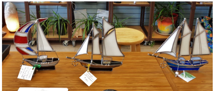
Stained Glass by Pamela Scribner