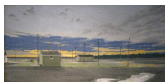
"Dusk" by Drew Scarpa

stepped up and contributed their time and expertise.