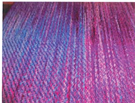
Sandra K. painted boucle