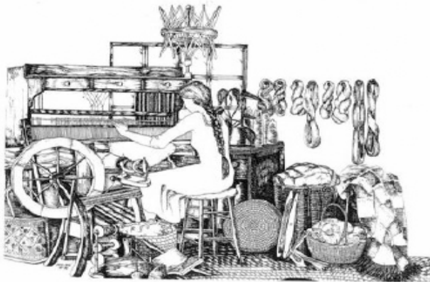
Joyce Jonte © 1980