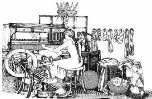
Joyce Jonte © 1980