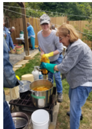
Mother and daughter dyeing with Osage.