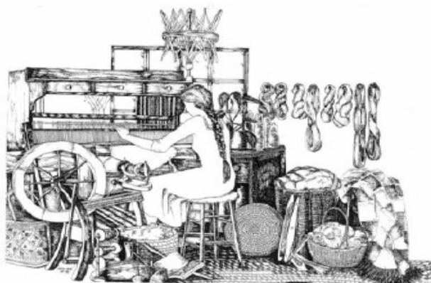
Joyce Jonte © 1980