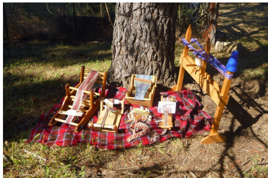
Some of Tracy's Little Looms