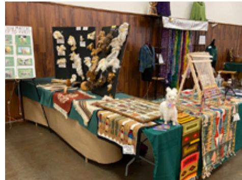
HHSG Booth at County Fair