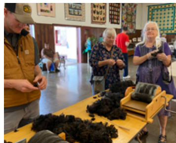
Public volunteers help pick