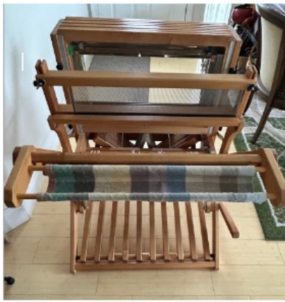
1 - Front view with Wolf Trap

Comes with: 18.5" 12 Dent Reed 400 Flat Steel Heddles (no longer made) 18.5" Raddle 18.5" Lease Sticks 18.5" Wolf Trap Stroller 2 Shuttles 400 Flat Steel Heddles (no longer made) All items purchased new from Schacht . I am original owner.