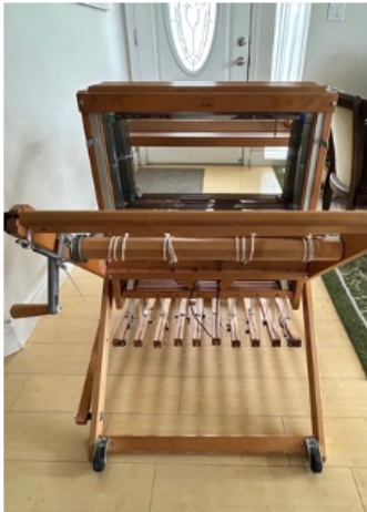
4 - Rear View