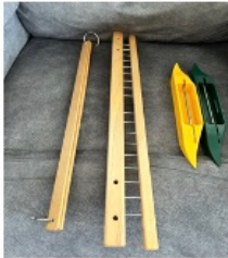
2 Lease Stick, Raddle & 2 shuttles

*Will meet to transfer within 50 miles from Sonoma, CA. *PayPal prior to pickup/delivery or cash on pickup *Contact jtipple@pacbell.net