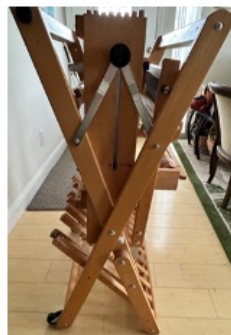
5 - Left side view