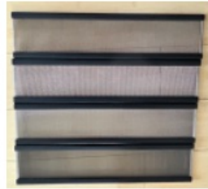
3 - 8, 10 and 15 dent reeds