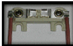
Ansi Code # 902 Socket for G6.35 base types