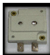
Ansi Code # TP27 Socket for GZ 9.5 base lamps