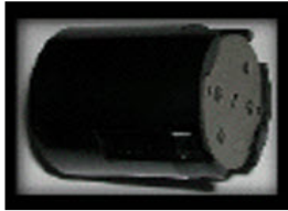
Ansi Code # 3743 Socket for Med. Pref. Lamps