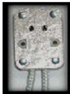
Ansi Code # TP120 Socket for G,GX,GY 5.3 base