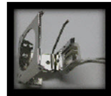
Ansi Code # H705 Socket for GZ6.35 base types