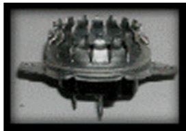
Ansi Code # 7460-0025 Socket for GX17Q base types