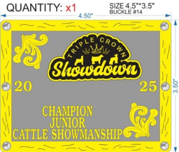
GS BACKGROUND HAND ENGRAVED WITH ANTIQUE WHITE BUFFALO.