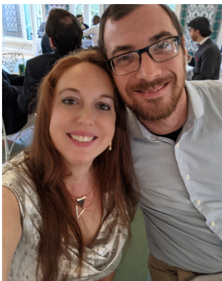
At a friends wedding