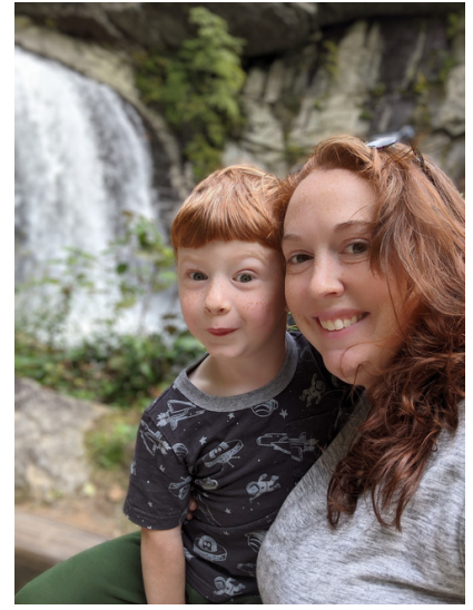
Chimney Rock State Park, 2021

We often go chasing waterfalls since we live in the mountains and "the land of waterfalls" is just one county away