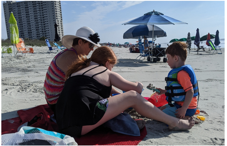
Playing with Nana and our cousins on the beach