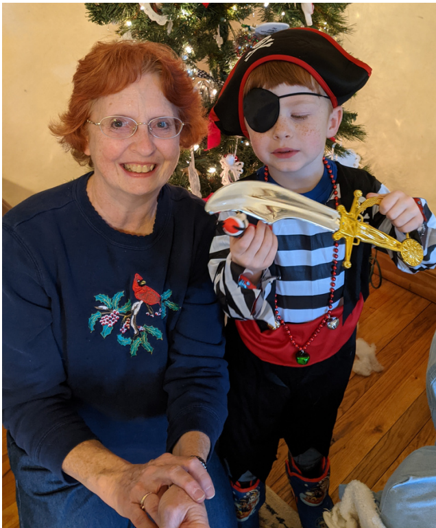
Playing dress up with grandma!