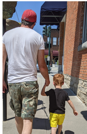
Walking downtown with dad