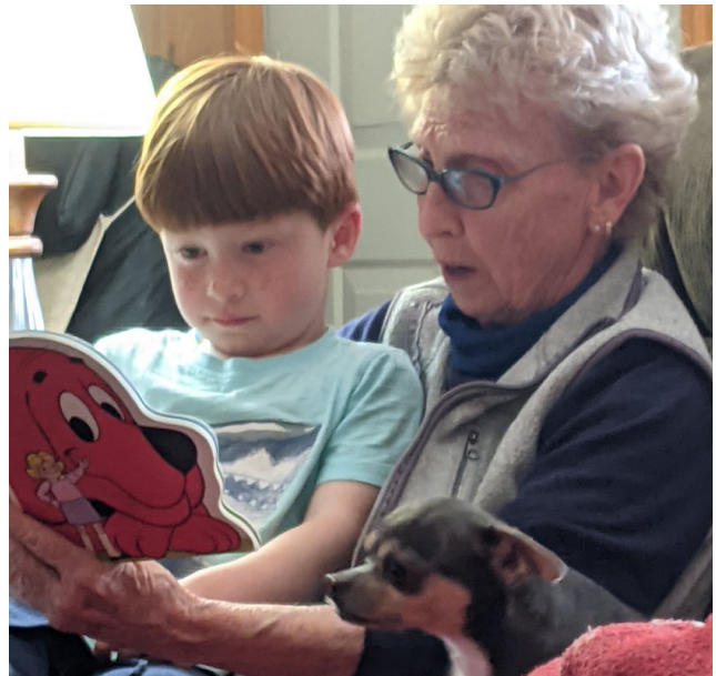
Reading with Great Grandma