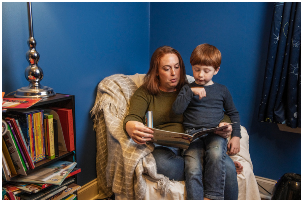
We love to read together! We do so each and every day!