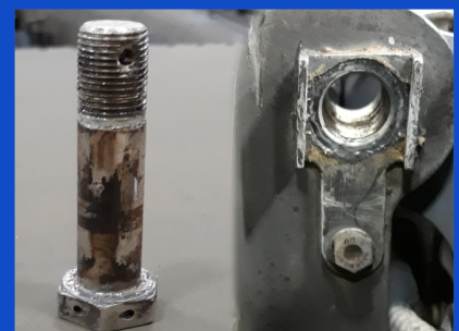
BOLT PIN REMOVAL WITHOUT DAMAGE