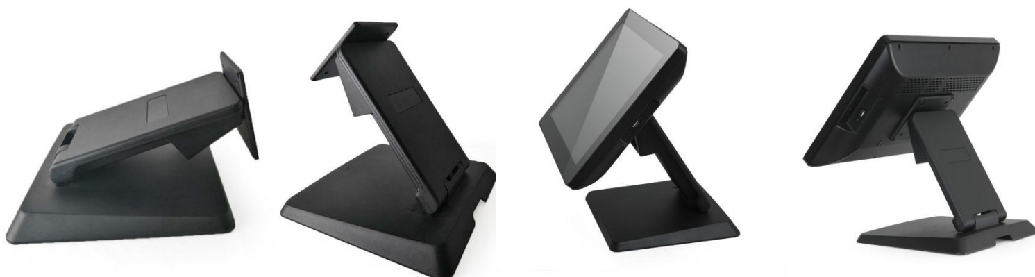
MS-09B dual screen stand