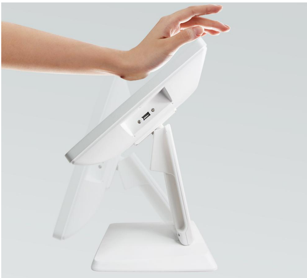
MS-09A single screen stand

Full aluminum alloy big base, Foldable , with 2 rotating axes, super stable and durable