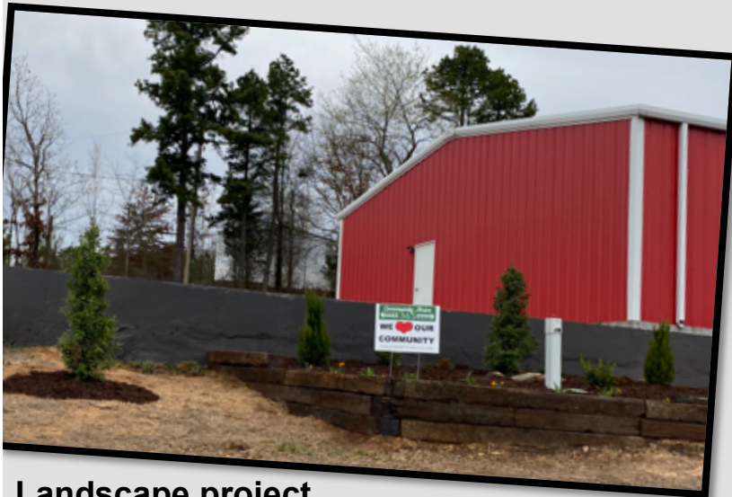
Landscape project completed at the Pulaski County Sheriff Substation located on Mundo Road