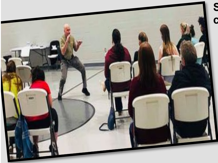
Self-defense and awareness class provided on February 25