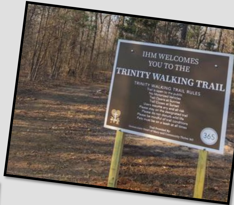
New Trinity Walking Trail open dawn to dusk and located on Jasna Gora Drive by the Immaculate Heart of Mary Catholic Church