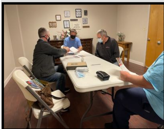
Helped over twenty families receive free energy audits for their homes in hopes of helping them reduce energy cost