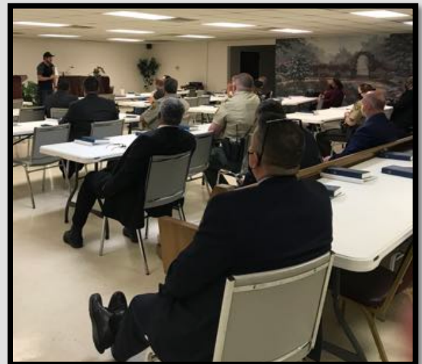
Partnered with PCSD to begin a new Neighborhood Crime Watch group for the Crystal Hill area. They meet the third Tuesday of every month at Crystal Valley Baptist Church at 6:30pm