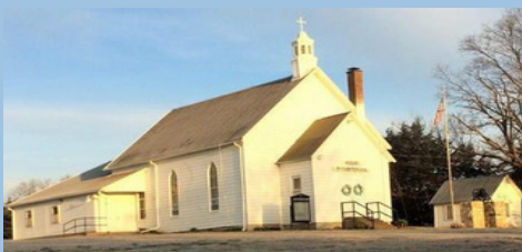
Miami 8:00 am