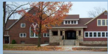
Osawatomie 10:00 am