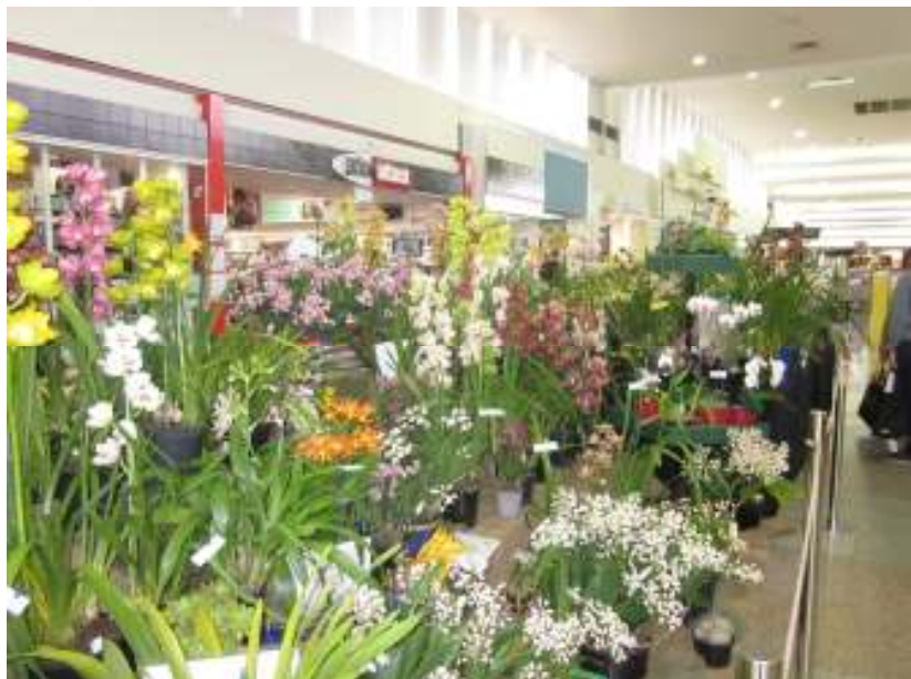
The Club Display for the Spring Show at Arndale shopping Centre