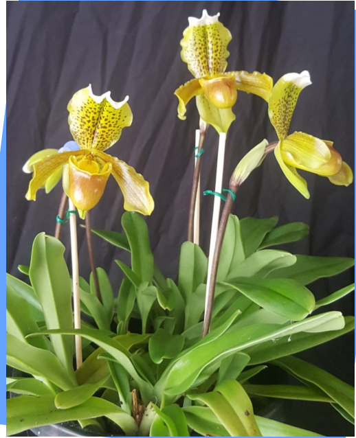
Orchid of the Day and Orchid of Second Division Paphiopedilum insigne Grown by Gary Clark