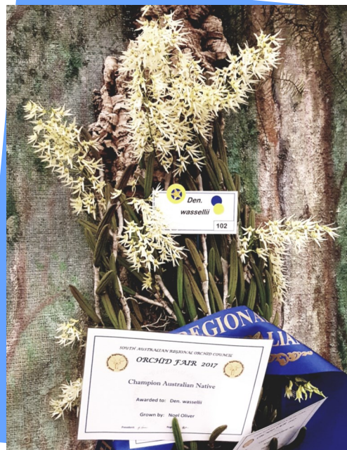
Champion Australian Native Den. wassellii Grown by Noel Oliver

Champion of Show was Noel Oliver's Den. Wamberal pictured on page 13