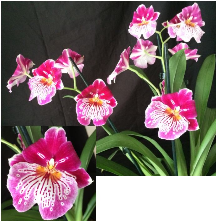
Orchid of Second Division Plant of the Day & Popular Vote