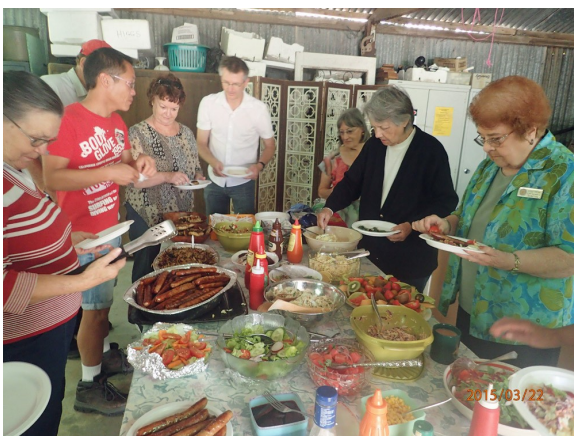
Above: We certainly enjoyed a magnificent feast.