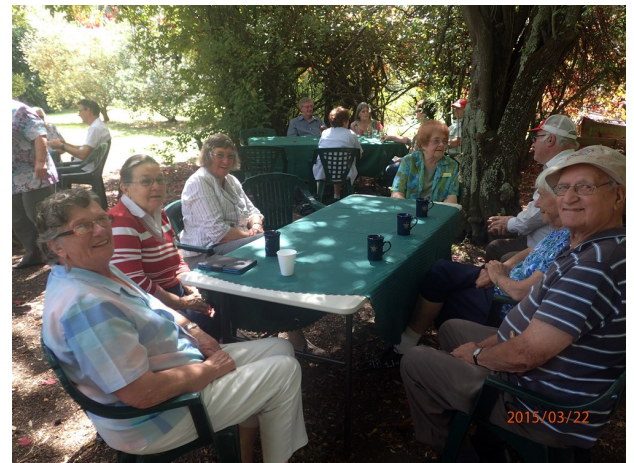
Above right & right: Members relaxing under the trees.