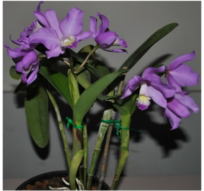
Above: Orchid of First Division Ctt. Browniae 'Riga' benched by Eileen Pinnock