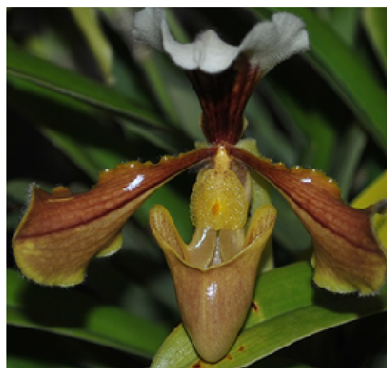
Flower of the Day & Popular Vote winner Paphiopedilum villosum benched by Ruth Tugwell.