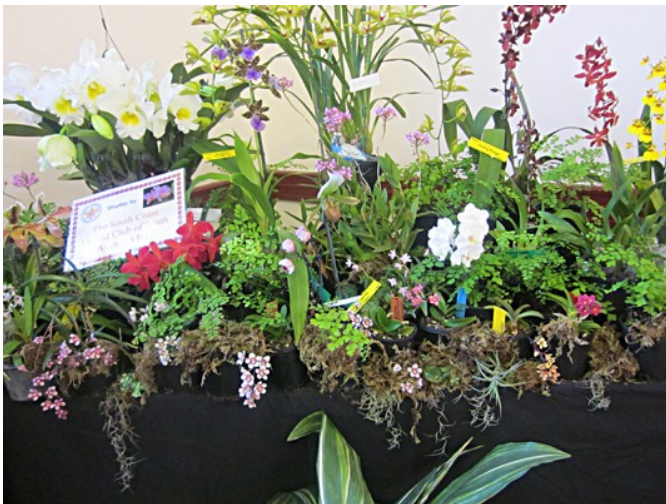
Left: Part of the SCOCSA display at the Bonsai Club Annual Show.

BONSAI CLUB ANNUAL SHOW: The club held a display and trading table at the annual Bonsai Club Show on 18th October at McLaren Vale. It was a lovely day and the people at the Bonsai show seemed to really enjoy our display. Thank you to the Bonsai Club for inviting us to participate.