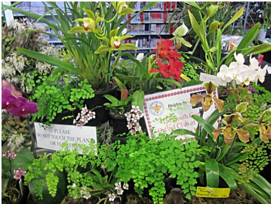
Left: Part of the SCOCSA display at the Unley Library.