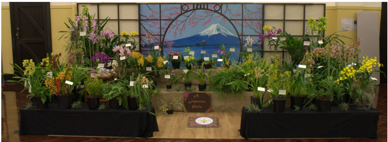
The SCOCSA display at the SAROC Fair