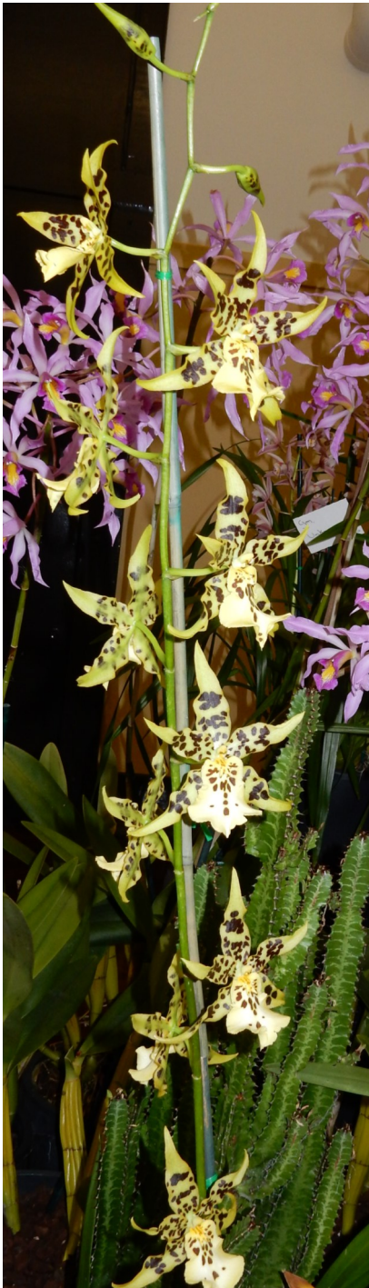
Champion Oncidiinae - Brsdm. [McIna] Pagan Love Song 'Ruby Charles'