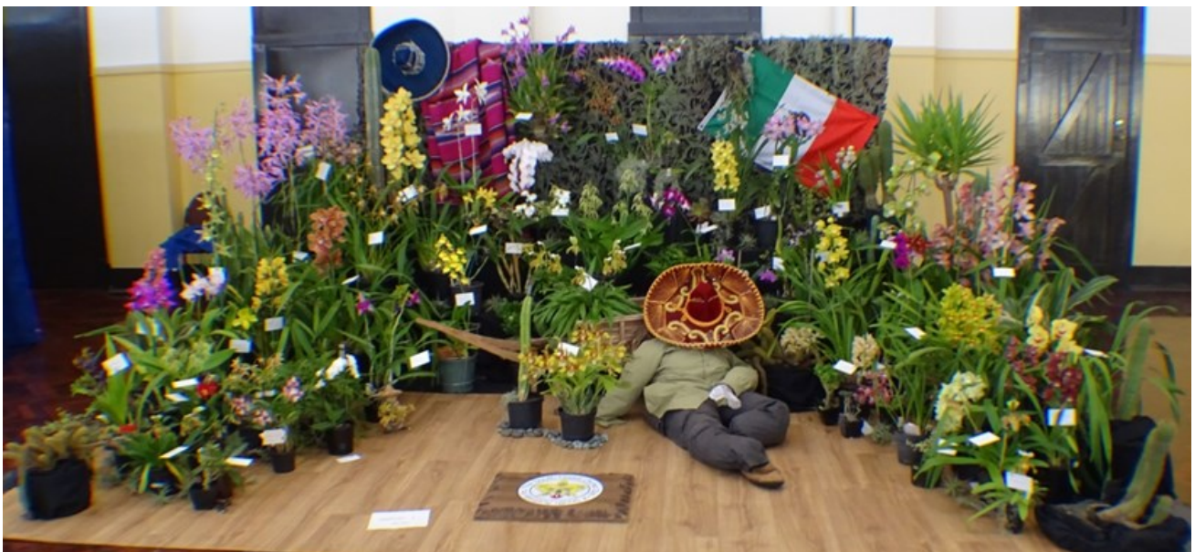
South Coast Orchid Club Display at the SAROC Fair