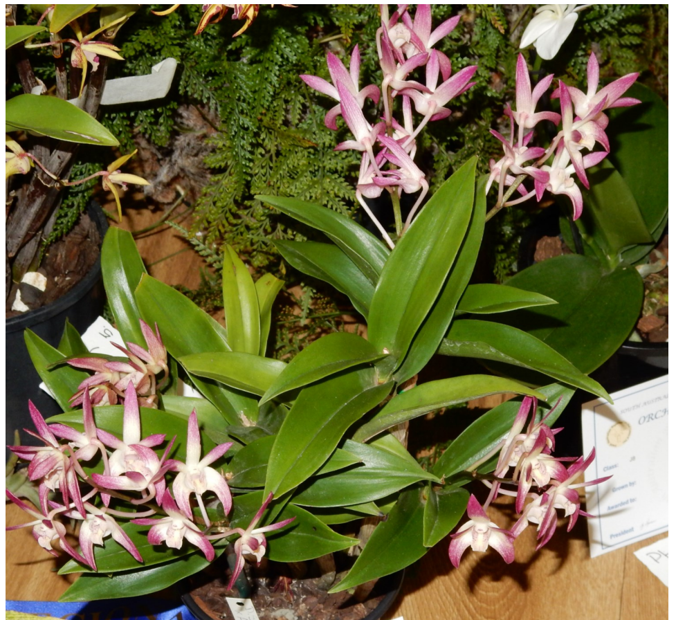
Champion Australian Native - Den. Saigon Victory 'Springers 13'