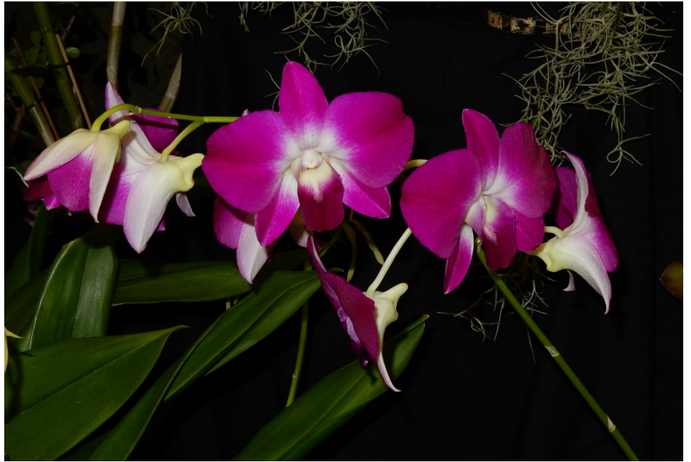
Champion Other Genera - Den. Unknown